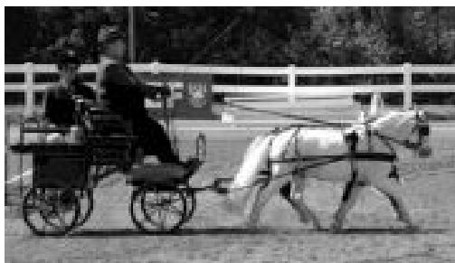
Echo Falls Rhetts Socks