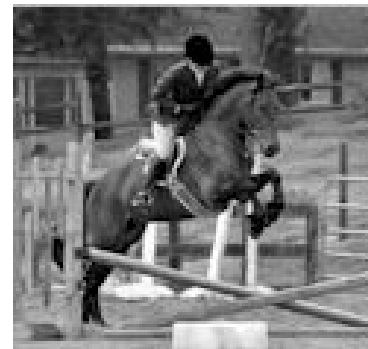
Davric Honey Bee