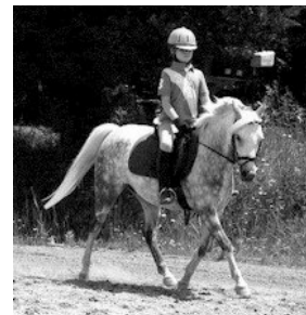
Ember Under Saddle 2009

Additional information, pictures & ponies and cobs for sale at - www.casmaranstud.com