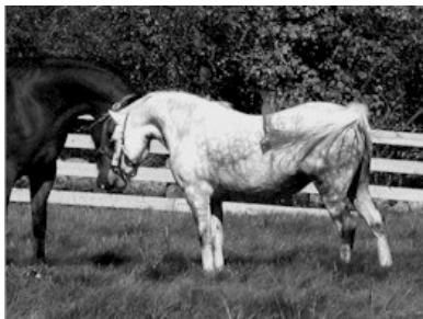
Ember Sept 2009 at home

Cross Creek Ember – small Section B Welsh mare, easy measure, very fancy, has mileage, eligible everything, great stride, best jump, completely honest . This pony can wear many hats. Come try her, you'll love her. For Sale, or lease to the right performance home.